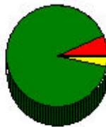
Home Heating Source