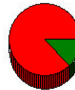
Relationship of Occupant