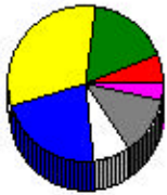
Education - Highest Level Attained