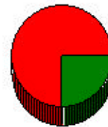
Relationship of Occupant