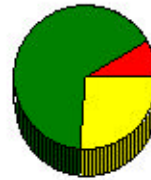
Education - Current Enrollment