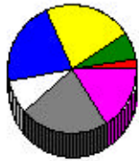
Education - Highest Level Attained