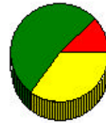
Education - Current Enrollment