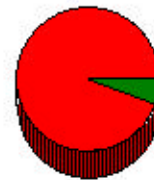
Relationship of Occupant