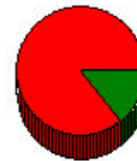
Relationship of Occupant