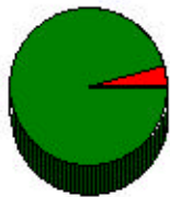
Home Heating Source