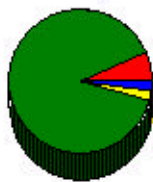
Home Heating Source