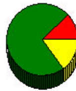
Education - Current Enrollment