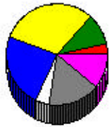
Education - Highest Level Attained