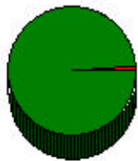
Home Heating Source