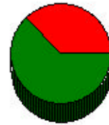
Education - Current Enrollment