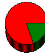
Relationship of Occupant