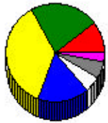
Education - Highest Level Attained