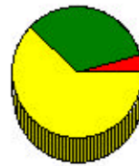
Education - Current Enrollment