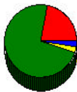
Home Heating Source